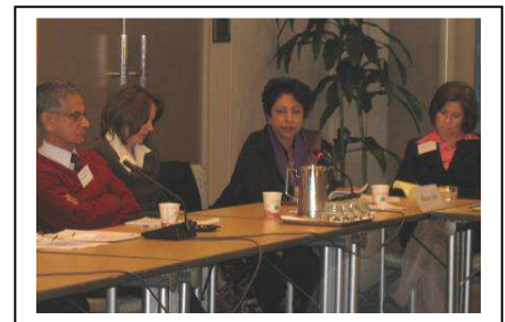
Dr Maleeha Lodhi, former Pakistani ambassador to the US.