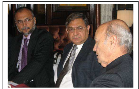
Hon. Ahsan Iqbal, Brig. (ret.) Feroz Hasan Khan, and Gen (retd) Talat Masood at breakfast for national press at the Old Ebbitt Grill.