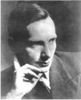
Joseph Rotblat as a young man.

One could not help admiring this man of indomitable energy, moral integrity and high culture. Yet the most important thing about him was that even in very old age his mind remained crystal clear and his convictions firm. In a changed world facing new challenges, he addressed the people, ordinary citizens as well as world leaders, with an urgent appeal to rid the world of nuclear weapons, for in the final analysis this is the only way to a secure existence for future generations. Expressing my condolences for the passing of this remarkable man, I pay tribute to his long and eventful life, dedicated to serving the people, a life that is truly an