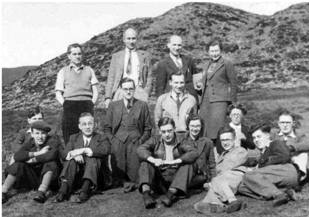
With students from the University of Liverpool at Llandudno just after the war.